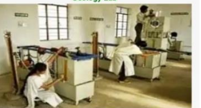
Fluid Mechanics and Hydraulics lab