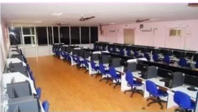
Tim Berners Lee Computer Lab