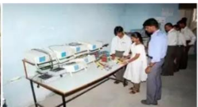
Control Systems Lab