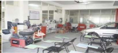
Four Wheeler Assembly Lab