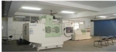
CNC Machines Lab