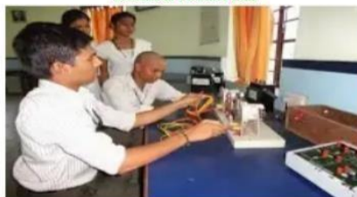
Power Electronics Lab