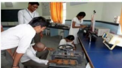
Electrical Measurements Lab