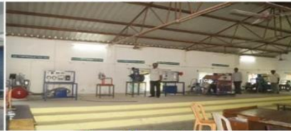
Thermal Engineering Lab