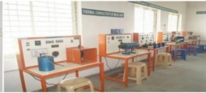
Heat Transfer Lab