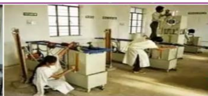
Fluid Mechanics and Hydraulics lab