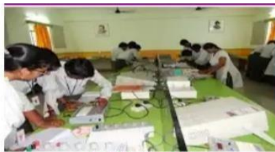
Basic Electronics Lab