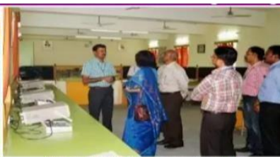
Analog & Digital Communications Lab