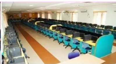
Dennis Ritchie Computer Lab