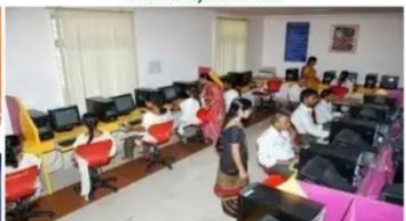
Simulation of Electrical Systems Lab