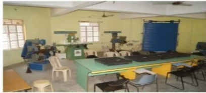
Machine Tools Lab