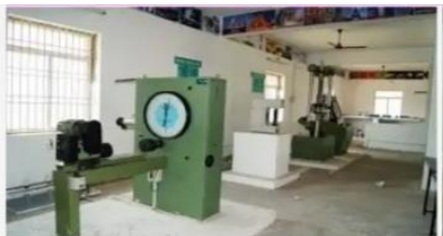
Strength of Materials Lab