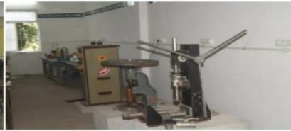
Production Technology Lab