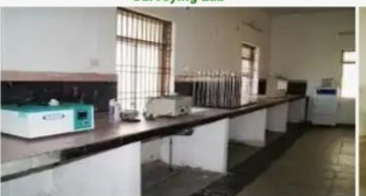
Environmental Engineering Lab