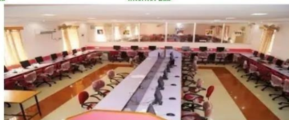
Cisco Networking Lab