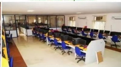
JKC & Projects Lab