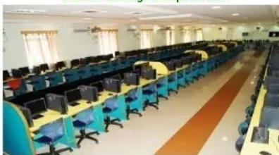
Ken Thompson Computer Lab