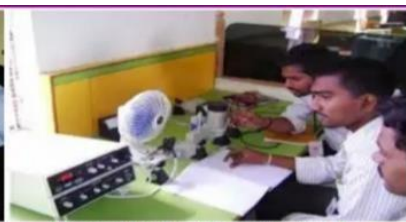
Microwave & Optical Communications Lab