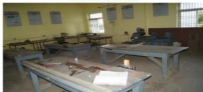
Sheet Metal Trade