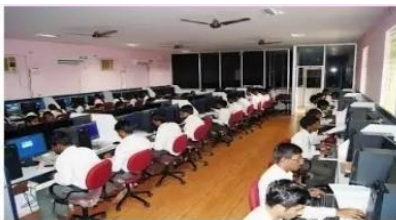
Charles Babbage Computer Lab