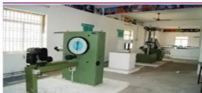
Strength of Materials Lab