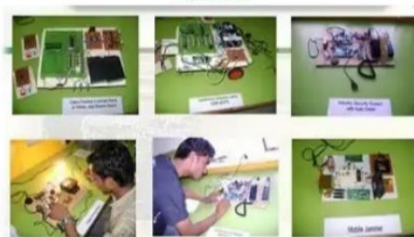
R&D and Project lab