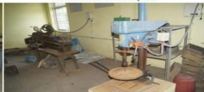
Lathe Machine Shop