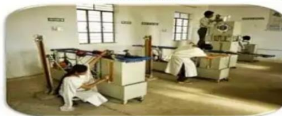
Fluid Mechanics and Hydraulic machinery