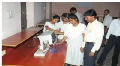
Electrical Circuits Lab