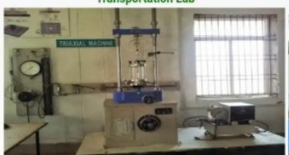
Geotechnical Engineering Lab