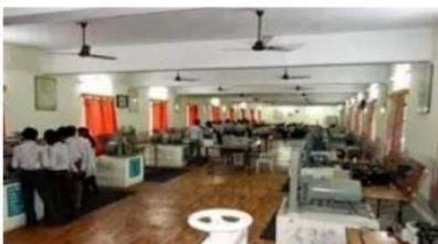
Electrical Machines Lab